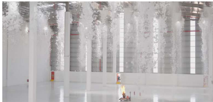
*High-Expansion FireFoam System