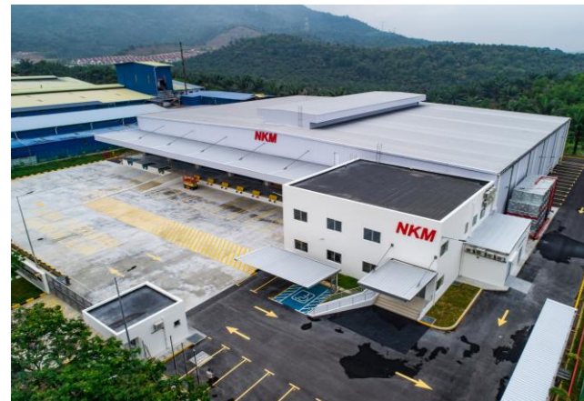
NIPPON KONPO (MALAYSIA) SDN BHD

Plus PM Consultant got involved deeply in the project and the members were pleased and proud to be able to obtain the satisfaction of the client throughout the cost, quality, schedule and safety management of the project.