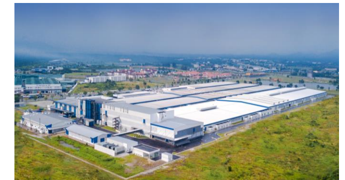
TOYO TYRE MALAYSIA SDN BHD

bring an impact to the construction schedule. However, with full cooperation of the entire project team, we were able to overcome the difficulties and completed the delivery on schedule. When the members of Plus PM Consultant attended the opening ceremony, we felt a strong sense of joy and accomplishment.